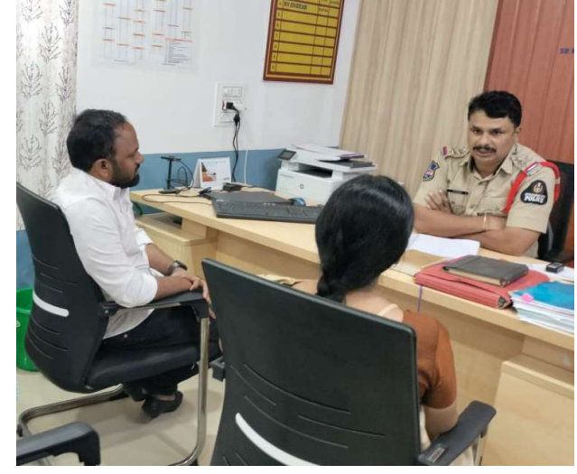
Pic 2 – Interview with SHO, Borabanda