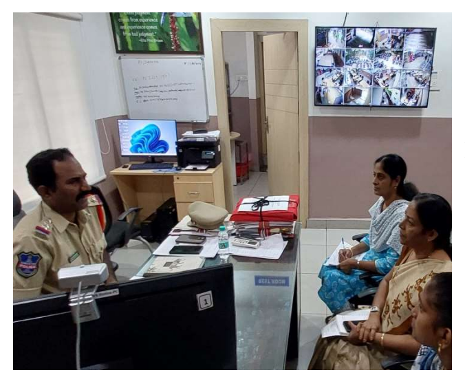
Pic 1 – Interview with SHO, Jubilee Hills