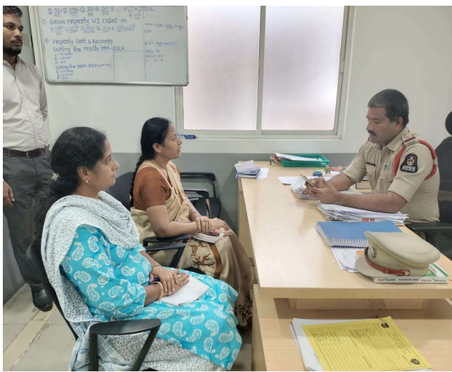
Pic 3 – Interview with SHO, Madhura Nagar