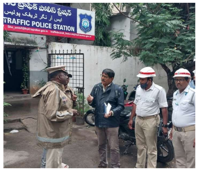
Pic 21 & 22 – Interaction with traffic Police Inspectors & the Commuter