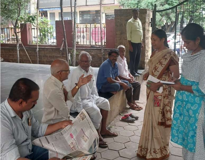
Pic 8 – Interaction with Commuters