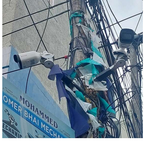
Pic 11 to 16 – CCTV Cameras set up in different main roads and lanes of the three localities