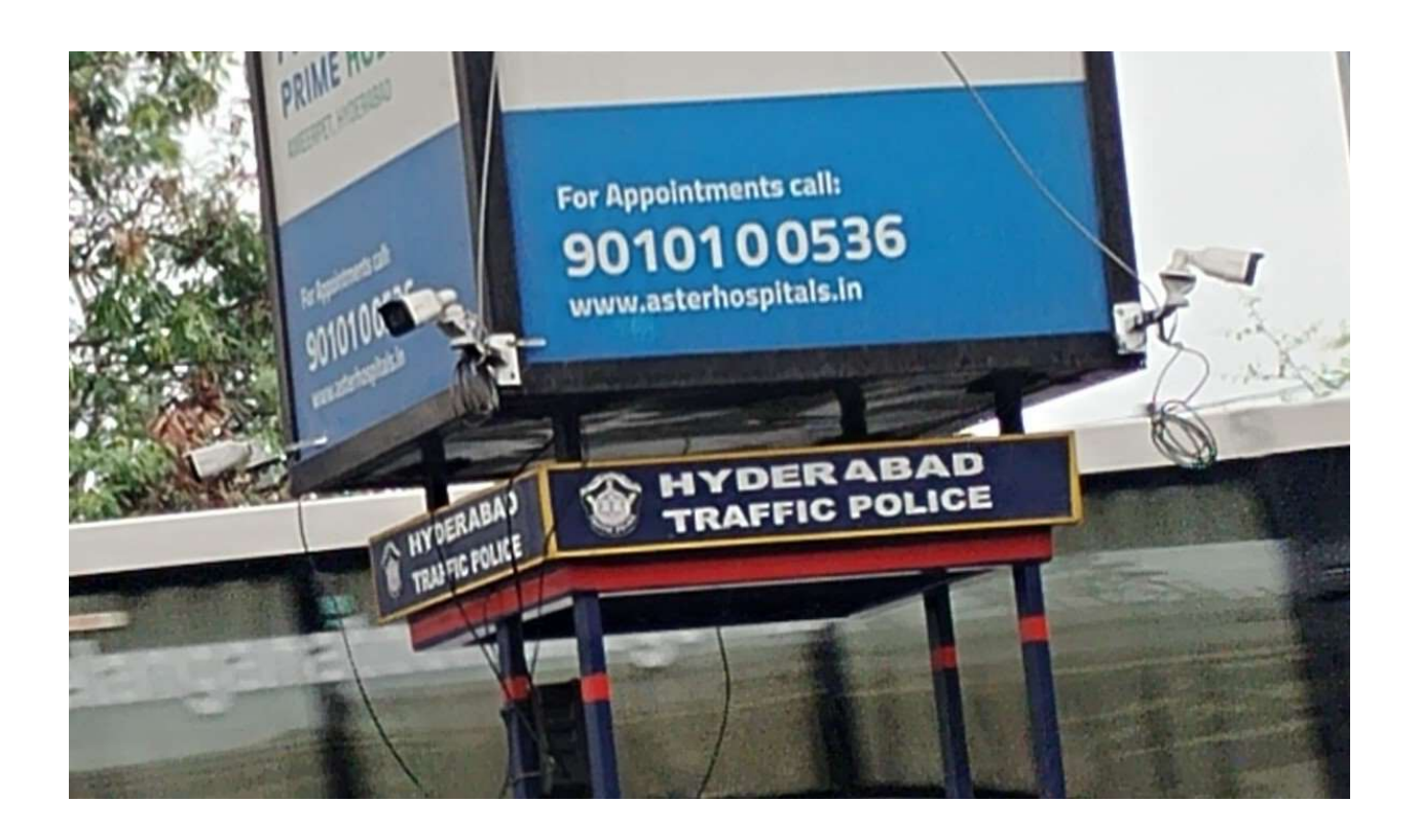
Pic 10 – Image of a Traffic Police post fixed with CCTV Cameras on the Main Road