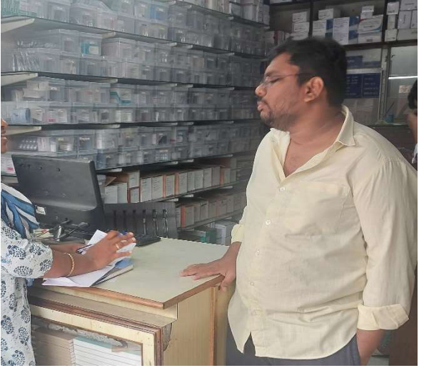
Pic 6 & 7 – Interactions with Sugarcane Juice Vendor and a Medical Shop Owner